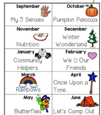
Play to Learn Preschool Thematic Units

Theme based approaches work well with group activities, research work, self and peer appraisal, hands-on crafts, interesting storybooks, essential conversations, and skill-building activities.